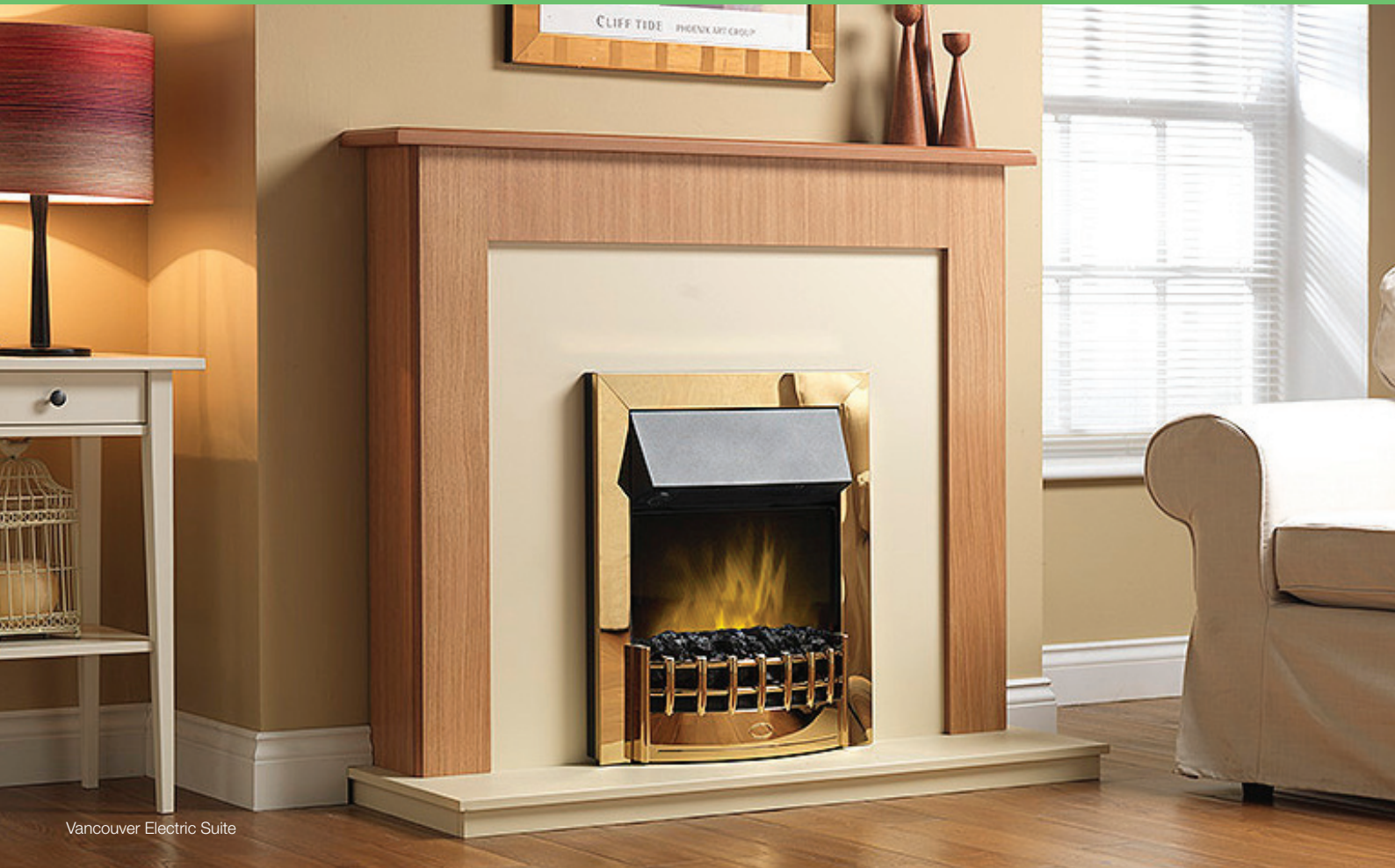
Vancouver Electric Suite