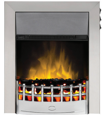
SuperEco Classic II Chrome