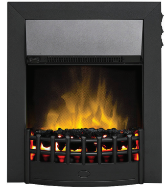
SuperEco Classic II Black