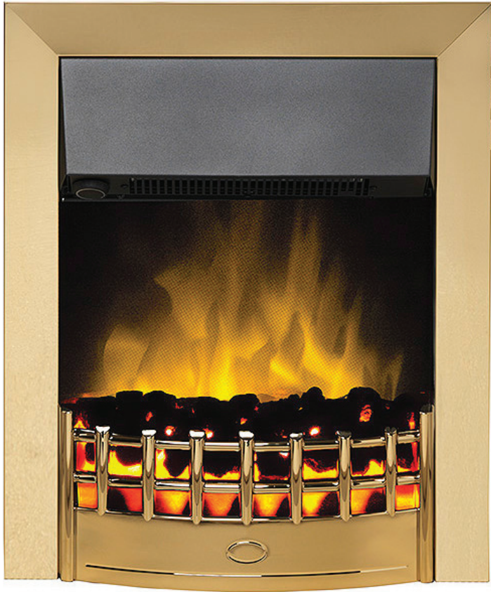
SuperEco Classic II Brass