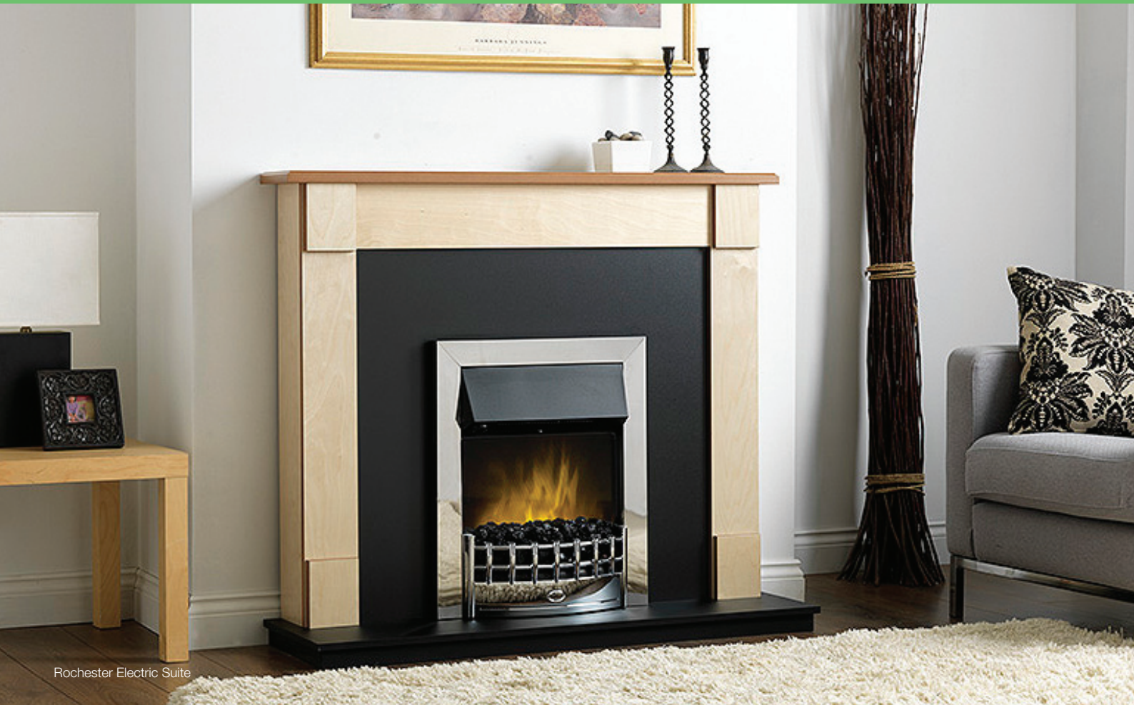
Rochester Electric Suite